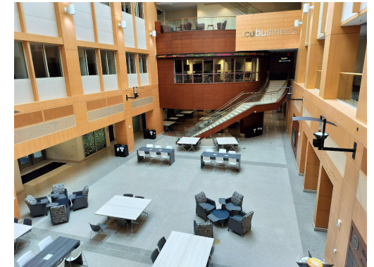
Business Hall Atrium