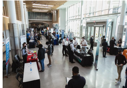
Engineering Research Building (ERB) Atrium