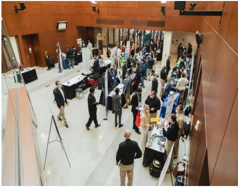
East Hall Atrium