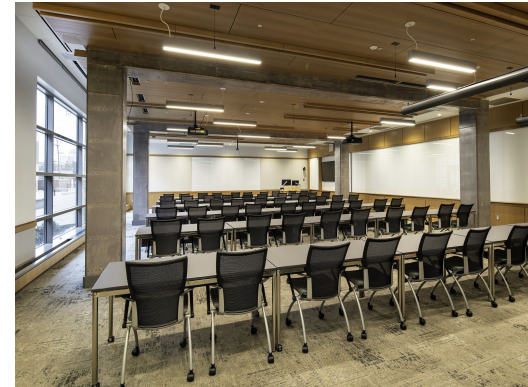
ERB Room 1313